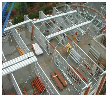
Silver Cloud Inn, Seattle WA, USA. Load-bearing wall placed, ready for steel deck.