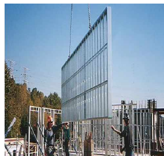
Light weight panels are easy to handle for rapid placement.