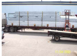
Prefabricated panels ready to ship to site

components properly fit and align throughout the entire project.