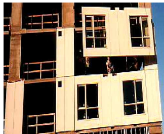
Panels are delivered complete with windows

• Our in-house automated design process insures that all components properly fit and align throughout the entire project.