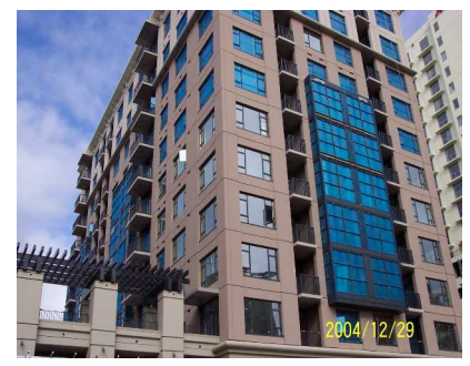
Trellis, San Diego, CA, USA, rain screen panels