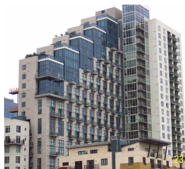
Treo, San Diego CA, USA 26, storey Tower