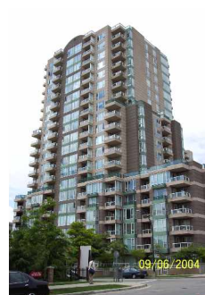
Emerald Park, Vancouver, BC, Canada